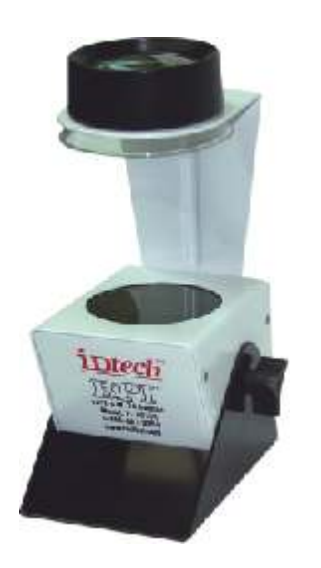
BPI ID Tech™