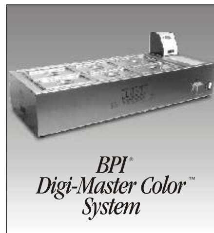
BPI® Digi-Master Color™ System

To change the set temperature, press the 'UP' or 'DOWN' button. The new set temperature will be displayed for several seconds, then the display will return to displaying the actual tank temperature. Temperature settings are usually 200-210°F (93-98°C) or 190-200°F (88-93°C) for gradients and light tints). If there is going to be a time lapse between batches, the unit may be idled at 150°F (65.5°C) and the lids placed on the dye tanks to minimize evaporation and reduce the time it takes to attain operating temperature for the next batch. Since the pigment does not evaporate, you may simply add water from time to time to replace evaporative losses.