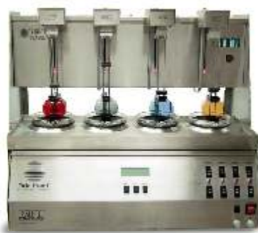
BPI Turbo Gradient 4™

Program 6: Similar to program 5 but less aggressive.